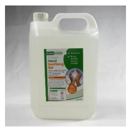
Unit: 500ml | Case: 12 x 500ml